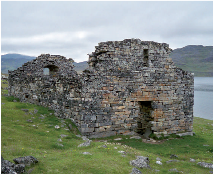
Ruins of Hvalsey Church, Greenland.

Why were crosses found near many of churches, while the artefact was only near one especially big church?